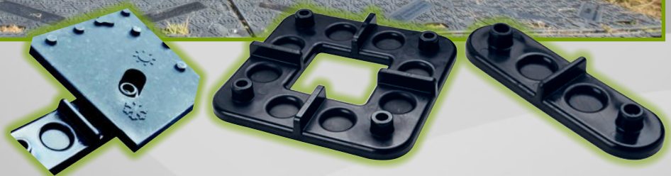
Simple. secure fixing system